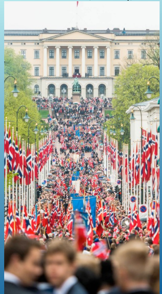
Oslo, 17th of May, Parade

DAY 3 - VIKING MUSEUM: Enjoy a delightful breakfast at our hotel, which is included every day of our tour. We transfer to the museum district, where we will pay a visit to the Viking Museum, which displays the history and infrastructure of Norway during the Viking period. We return to our hotel, and enjoy the evening at leisure. [B]